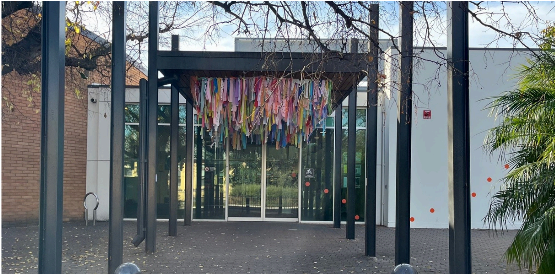
This is the entrance to the West Torrens Library on Brooker Terrace.