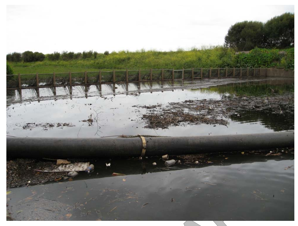
Brown Hill Creek, Watson Avenue Trash Rack, Floating Boom and Sediment Basin