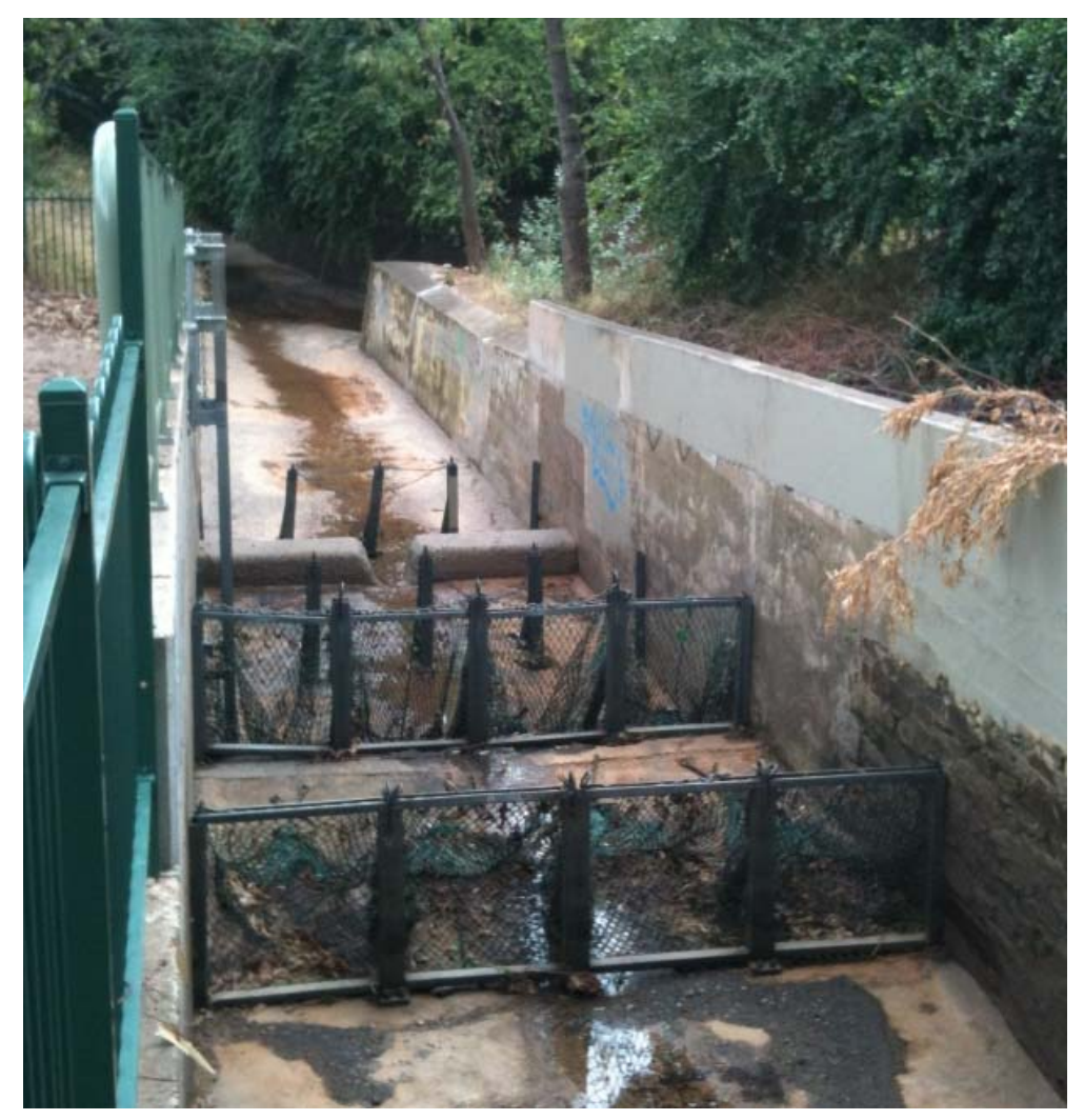
Glen Osmond Creek, Simpson Parade Trash Racks