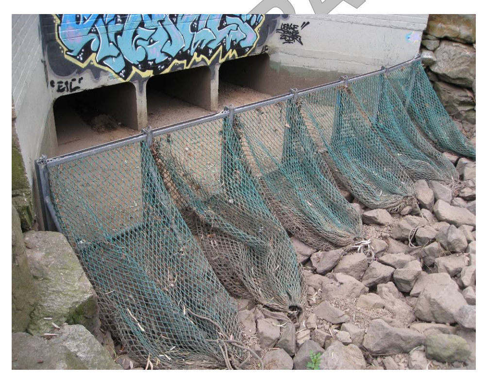
Parklands Creek, Park 20 Trash Rack