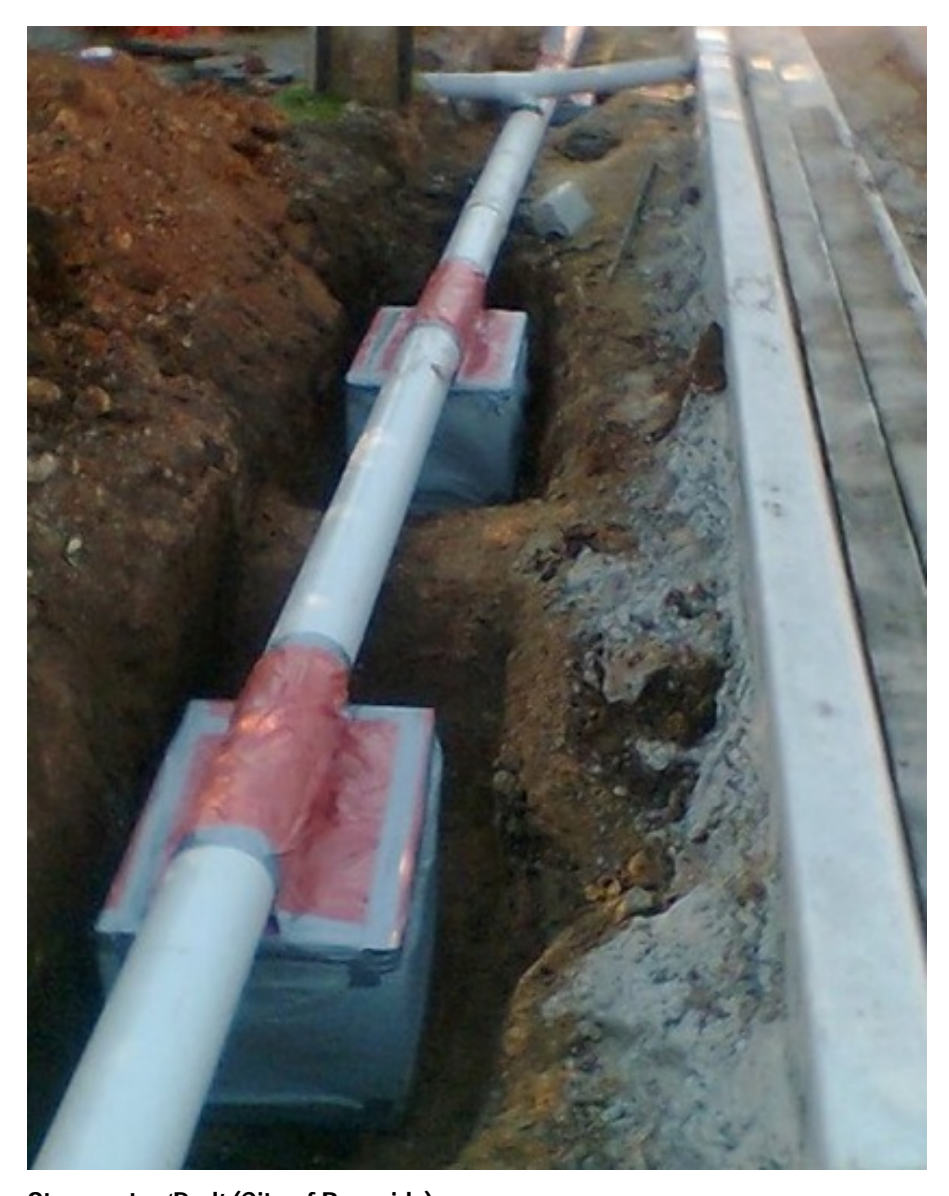
Stormwater 'Pod' (City of Burnside)